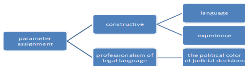
Figure 2 Parameter assignment which changed the mode of judicial trial

Today, artificial intelligence system has been widely used. Cognition is still the most insurmountable obstacle of artificial intelligence system, although this feature has been greatly improved. In the field of justice, human language is complex, and the investigation of facts and the adoption of evidence require judges to use their experience in daily life, and many personal factors are often introduced into it. Therefore, the constructive understanding of human judges plays an important role in the process of trial. In addition, the professionalism of legal language and the political color of judicial judgment have also deeply hindered artificial intelligence system judge independently in trial. A fully autonomous judicial trial is beyond the reach of artificial intelligence systems. Artificial intelligence system reconstructs the roles of appraisers, expert assistants and other trial participants, and also changes the knowledge structure and number of members of trial teams. In addition, it will have a great impact on the supervision and assessment system of judges. As is shown in the Figure 2, all these have profoundly changed the mode of judicial trial.